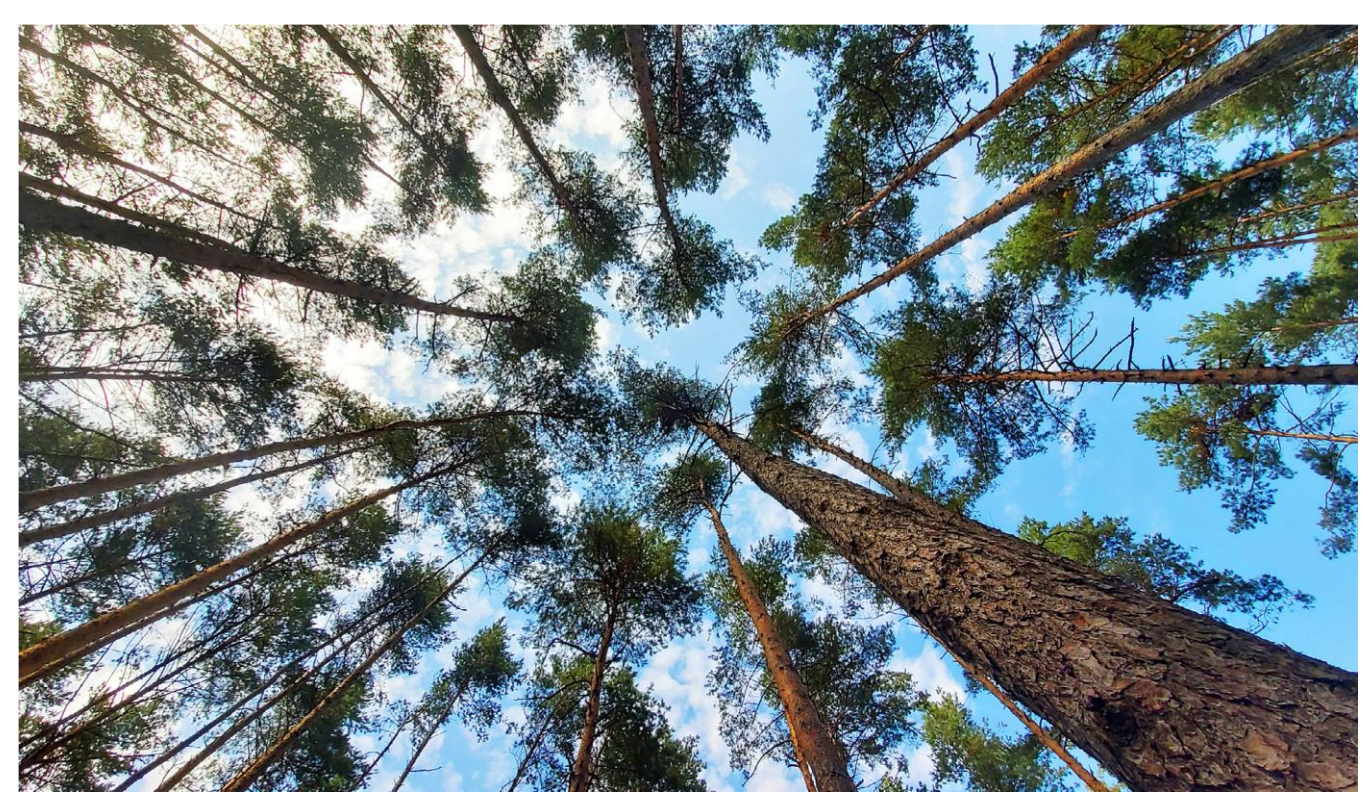
Calculated and produced in association with GovData 2022